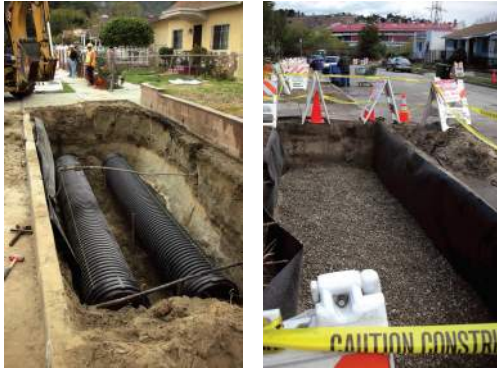
Installation of perforated pipes and gravel filter for the residential stormwater garden