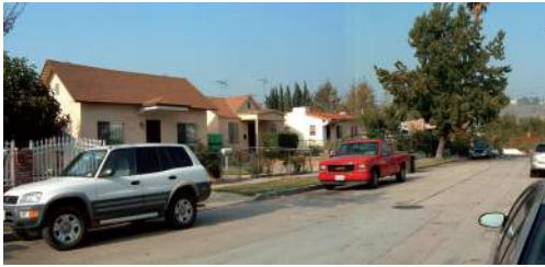
Pre-Oros Street construction