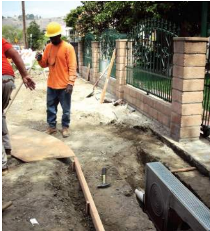
Installation of driveway trench drain that captures water runoff