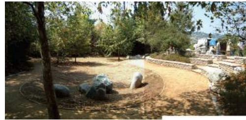
Steelhead Park before project begins