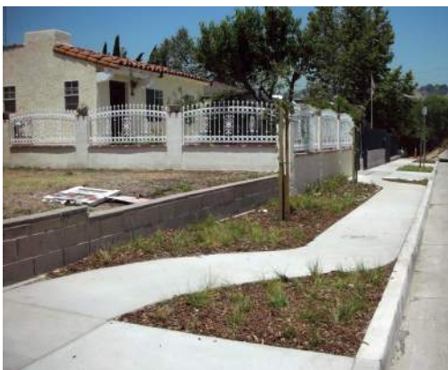
Residential stormwater garden with new sidewalks and plantings