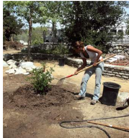
Revegetating Steelhead Park