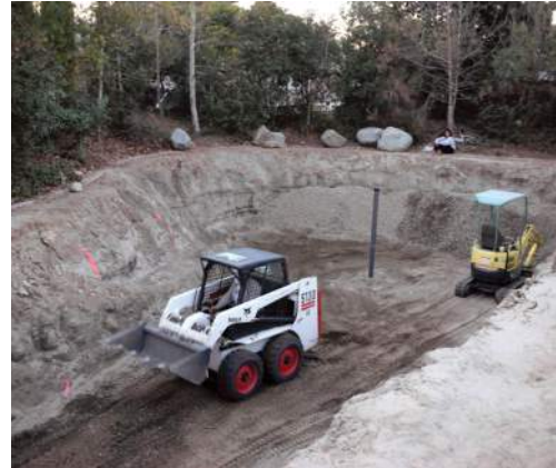
New stormwater garden under construction